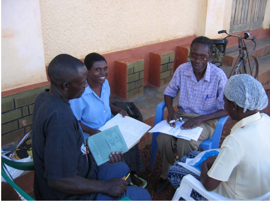
Literacy class being taught at Bombo Pentecostal Church